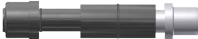
Expanded (Open Position)