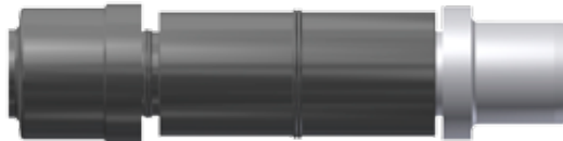
Collapse (Closed Position)